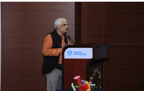
P. Sainath delivering the Parjanya Lecture

A decade after the closure of the 'Verrier Elwin Memorial Series' (1997-2007), Bhasha has instituted a new lecture series by the name, Parjanya . The lecture series marks the writer-activist Mahasweta Devi's demise in July 2016. Meaning 'rain' or 'cloud', the Parjanya lecture will be held during the monsoons, in July each year.