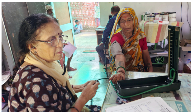
OPD in progress

This past year, the Centre offered treatment to 1800 patients (884 men, 752 women, 164 children) for skin, neurological, orthopaedic, cardiac, tuberculosis, urinary infections, sickle cell, respiratory, gastroenteritis and general complaints. Of these, 1325 were continuing patients and 475 were new cases.