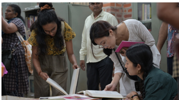
Library Reference Session

Titled ' Tribes in Transition ', the camp brought together 65 practicing Adivasi designers, artists, musicians and performers from the Munda, Kharia, Oraon, Tangkhul, Angami, Santhal, Karbi, Banjar, Bhil, Kachara and Rathwa communities from Gujarat, Maharashtra, Jharkhand, Orissa, Karnataka,