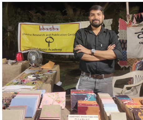
Banana Paper Products on display

Bhasha participated in the ' Farmers Nest Exhibition ' held to promote completely organic and chemical-free produce of farmers and entrepreneurs in Vadodara on March 15, 2024. Bhasha had on display banana paper products, Kasota textile and local art and craft.