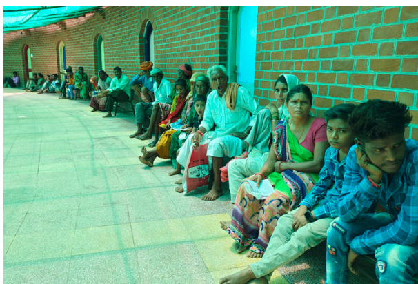
OPD at Tejgadh