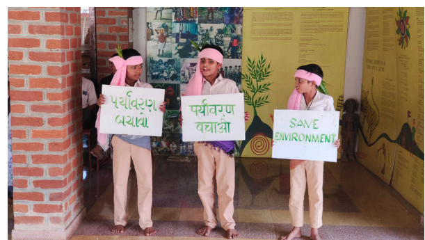
Celebrating Environment Day

Since 2005, the Adivasi Academy runs the ' Vasantshala Training Centre ' on its campus for out-of-school Adivasi children between 7 and 14 years of age. The intent is to bring excluded children to age-appropriate learning levels and to re-enrol them to local government schools and ashramshalas . Vasantshala's distinct point is to bridge the learning gaps of such children initially through the Mother Tongue and later transition them to the school language for the difference in the home and school language is the key reason for tribal school drop-outs. The Centre has successfully evolved as a bridge schooling programme for school push outs among Adivasi children. In 2022, Vasantshala was approved as a School by the Gujarat State Education Board for Classes I to V. In the past academic year, the Vasantshala School has had 54 children across Class I to V. Prioritising girl education, 45 percent of the enrolled children comprised girl students (24 girls and 30 boys).