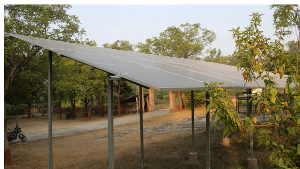
Solar Electricity Panels

To reduce the recurring energy costs at the Adivasi Academy towards electricity and LPG cylinder usage in the kitchen, Bhasha sought the support of the LIC Golden Jubilee Foundation, and set up a 20 KV Solar System on its campus. This includes Solar Panels for electrification and a hybrid Cooking System. Of this, 14 KV is the electricity requirement of the campus while 6 KV is utilised in the kitchen. The solar energy generated is transferred via grid to Gujarat Electricity Board. The Solar Cooking System installed at the Academy's kitchen enables cooking for about 200 persons at time. The system contributes to environmental betterment and economising costs.